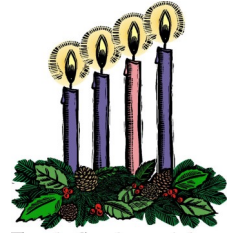
Fourth Sunday in Advent

Therefore the Lord himself will give you this sign: the virgin shall be with child and bear a son, and shall name him Immanuel. (Isaiah 7:14)