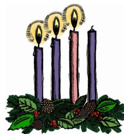
Third Sunday in Advent

The Third Sunday of Advent is known as Gaudete Sunday. The term Gaudete refers to the first word of the Entrance Antiphon, "Rejoice." Rose vestments are worn to emphasize our joy that Christmas is near, and we also light the rose candle on our Advent wreath. — excerpt from catholicculture.org